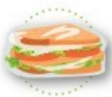
Ziploc & other reclosable food storage bags