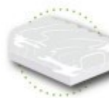
Wood pellet bags