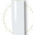
Pallet wrap & stretch film