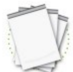
Plastic shipping envelopes