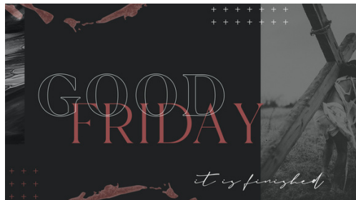
Good Friday - April 3rd @ 6:15 pm