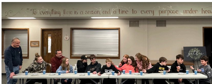
MSM Pose as the Last Supper