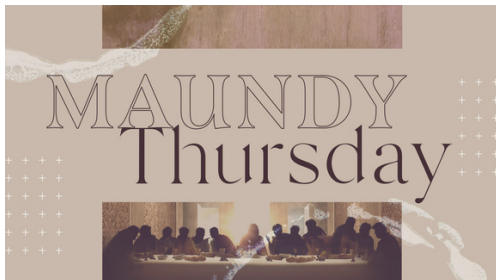
Maundy Thursday - April 2nd @ 6:15 pm