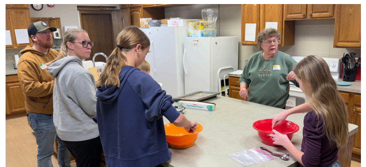
Making First Communion Bread