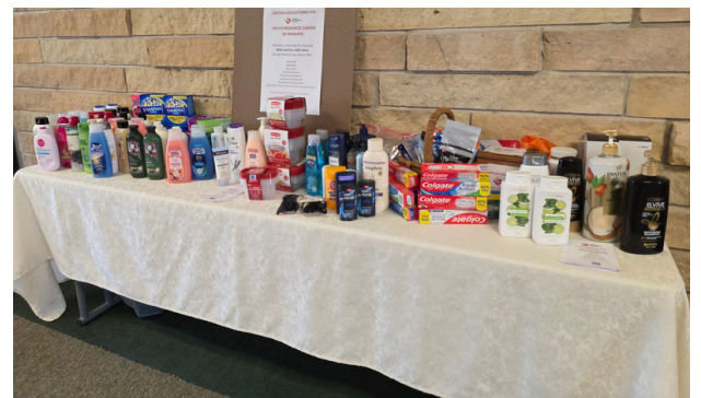
Youth Resources Donations