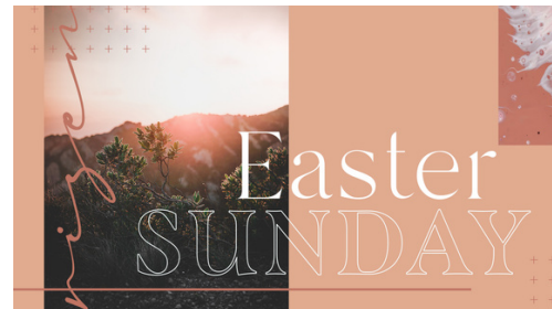
Easter Sunday - April 5th @ 8:30 & 10:30 Breakfast 9:15 - 10:15 am