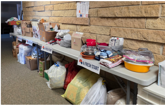
A Fresh Start Donations